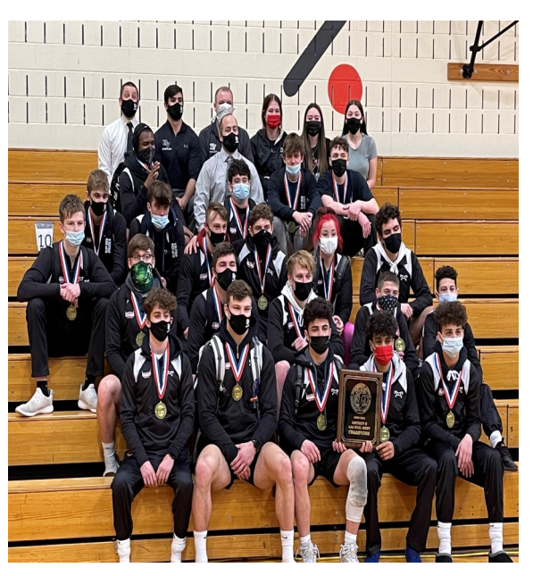
Delaware Valley Warriors Wrestling Camp 2022

1st-8th Grade July 6th-8th 9:00am- 2:00pm